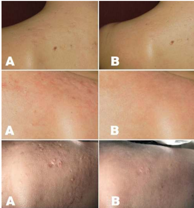
Fig. 5. Patients number 5, 8, and 10 (Table II). Treated areas corresponding to the shoulder and shoulder-blade regions. Atrophic and hypertrophic scarring can be observed (A), where the less pronounced scars disappear completely, and fading of the more severely pronounced scars occurs. Results at the end of the trial (6 months) (B).

Different radiofrequency methods on their own have been very effective in reducing facial acne scarring, with clear advantages over other methods, according to the researchers [2–6]. Three previous studies have evaluated the efficacy of Legato in the treatment of striae distensae [9,10] and hypertrophic scars [11]. The method of applying the Pixel RF was similar (not sufficiently detailed), but the Impact module was used to inject platelet rich plasma, retinoic acid, and triamcinolone, respectively. The results in both cases were surprising, striae were diminished by more than 60% [9] and hypertrophic scars practically disappeared [11].